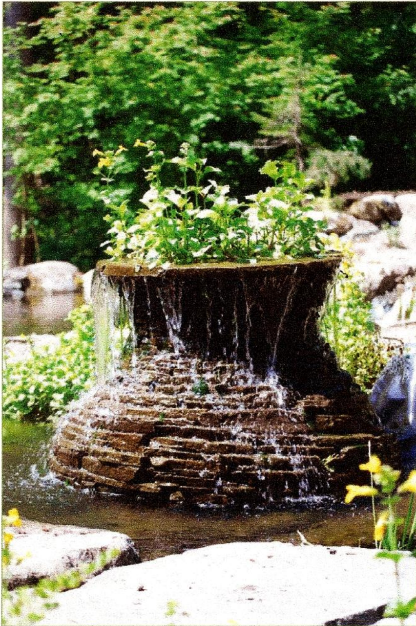
This urn waterfeature creates a tranquil feeling in an aquascape created by Stone People.